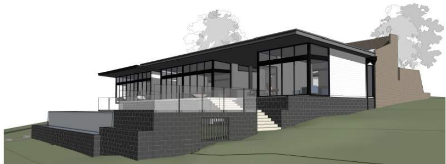
② North West Perspective