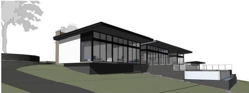
① North East Perspective