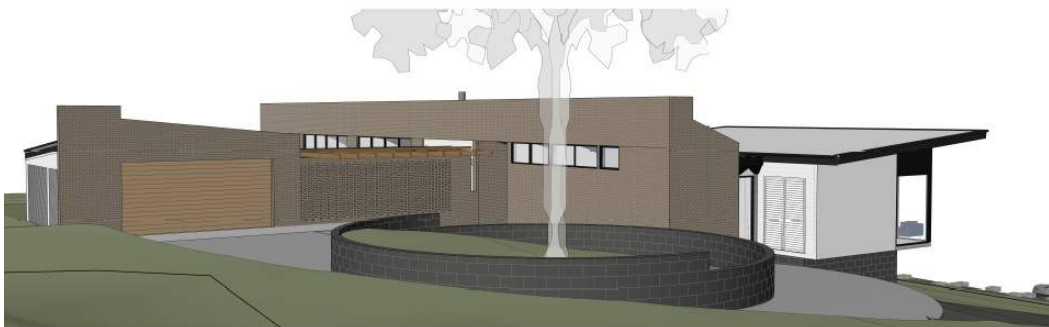
③ South East Perspective