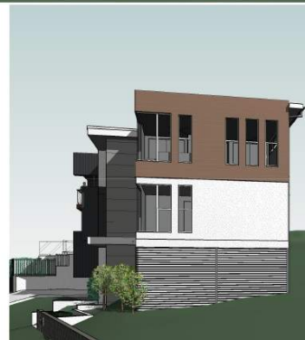
View from D'Arcy Road