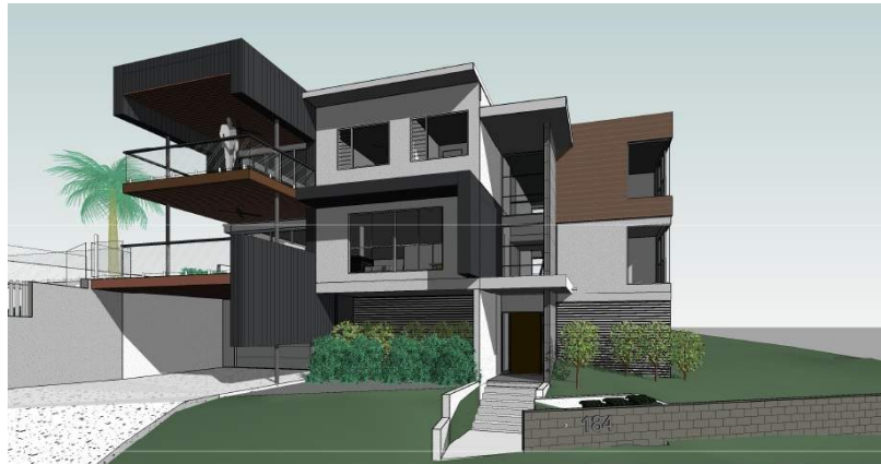
View from Miawela Street

Completion: 2017 (Construction recently started)